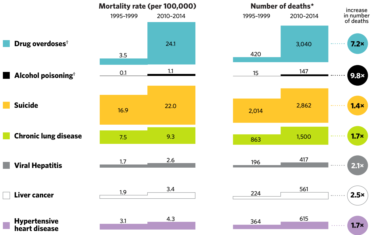
Figure 1. Increases in deaths among whites ages 25-59 years in Missouri, 1995-2014