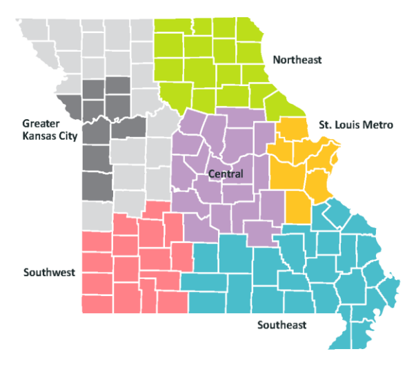
Exhibit 3. ECI regional hub structure