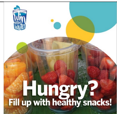
Image alt text: Hungry? Fill up with healthy snacks! Featuring fruit in a cup.

Looking for healthy refreshments? Our concession stand sells water for just [insert price]! #HealthyFutureMO