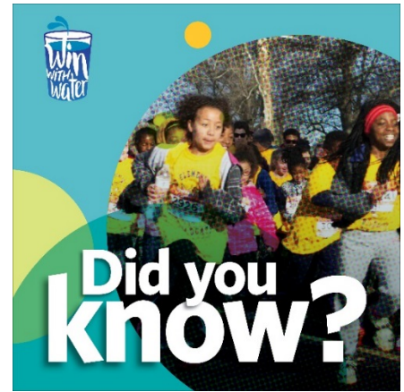
Image alt text: Did you know? Featuring dozens of young students racing.

It takes 50 minutes to run off a 20 oz. bottle of soda and almost two hours to walk off a 15 oz. bottle of juice. Water doesn't contain any calories! #HealthyFutureMO