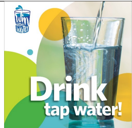
Image alt text: Drink tap water! Featuring water pouring into a glass.

Choose tap water to stay refreshed and save money. #HealthyFutureMO