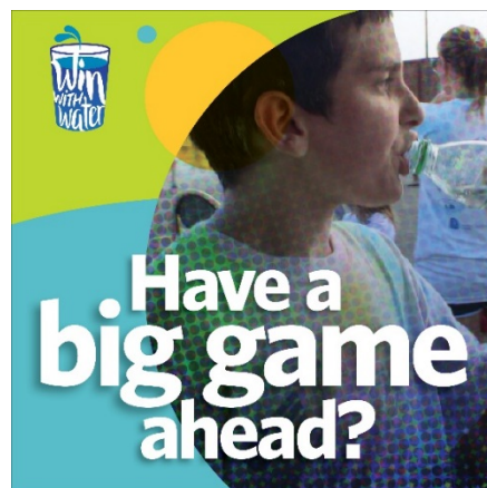
Image alt text: Have a big game ahead? Featuring young male student drinking water.

Win with Water by giving your body the fuel it needs! #HealthyFutureMO