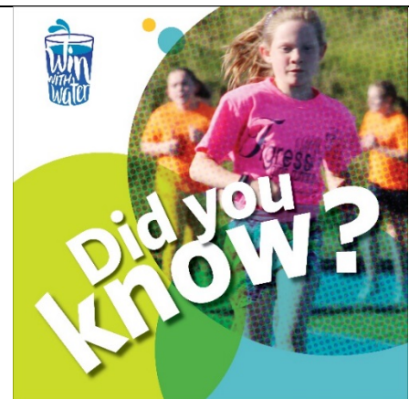
Image alt text: Did you know? Featuring young female student running in a race.

Muscles need water to work their best. It's important to drink water before, during, and after exercise. #HealthyFutureMO Image alt text: