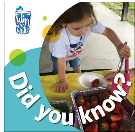
Image alt text: Did you know? Featuring young female student grabbing strawberries from a tray.

Water can be found in fresh fruits and veggies too, strawberries for example are 92% water! Eat them to stay hydrated! #HealthyFutureMO