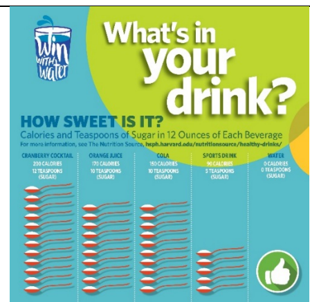
Image alt text: What's in your drink? Featuring a chart describing the calories and teaspoons of sugar in 12 ounces of different beverages.

What you drink is just as important as what you eat. Soda, energy or sports drinks, and some juices have a lot of added sugar. Win with Water to stay hydrated without the added calories. #HealthyFutureMO