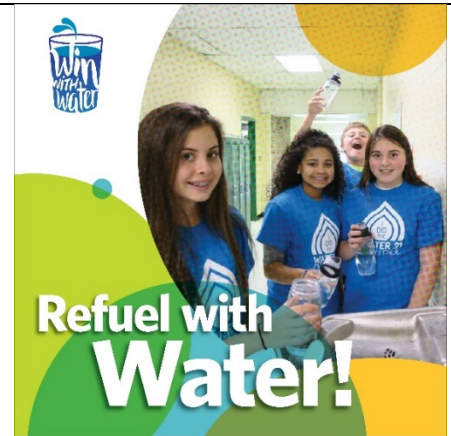
Image alt text: Refuel with water! Featuring four students at a water bottle filling station.

We've installed new water bottle filling stations at [location] ! Now you can easily fill up and win the day with water! #HealthyFutureMO