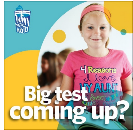
Image alt text: Big test coming up? Featuring young female student.

Win with Water—drinking water helps you focus! #HealthyFutureMO