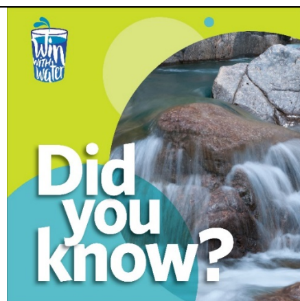
Image alt text: Did you know? Featuring image of the Missouri river.

The longest river in the USA is the Missouri River. The river is 2,340 miles in length—Missourians sure love their water! #HealthyFutureMO