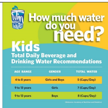
Image alt text: How much water do you need? Featuring a chart with kids total daily beverage and drinking water recommendations.

Make sure your kids are drinking enough water. Use this chart to figure out how much they need each day! #HealthyFutureMO