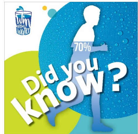
Image alt text: Did you know? Featuring icon of a person filled 70 percent with water.

Water covers around 70% of the Earth's surface and makes up about 70% of a child's body. Drink water to stay hydrated! #HealthyFutureMO